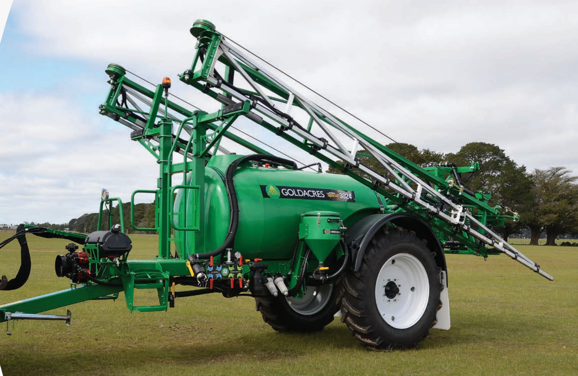
Prairie Special 3000L with 24m Delta boom shown