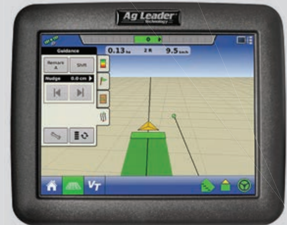
Ag Leader® - ISO Bus