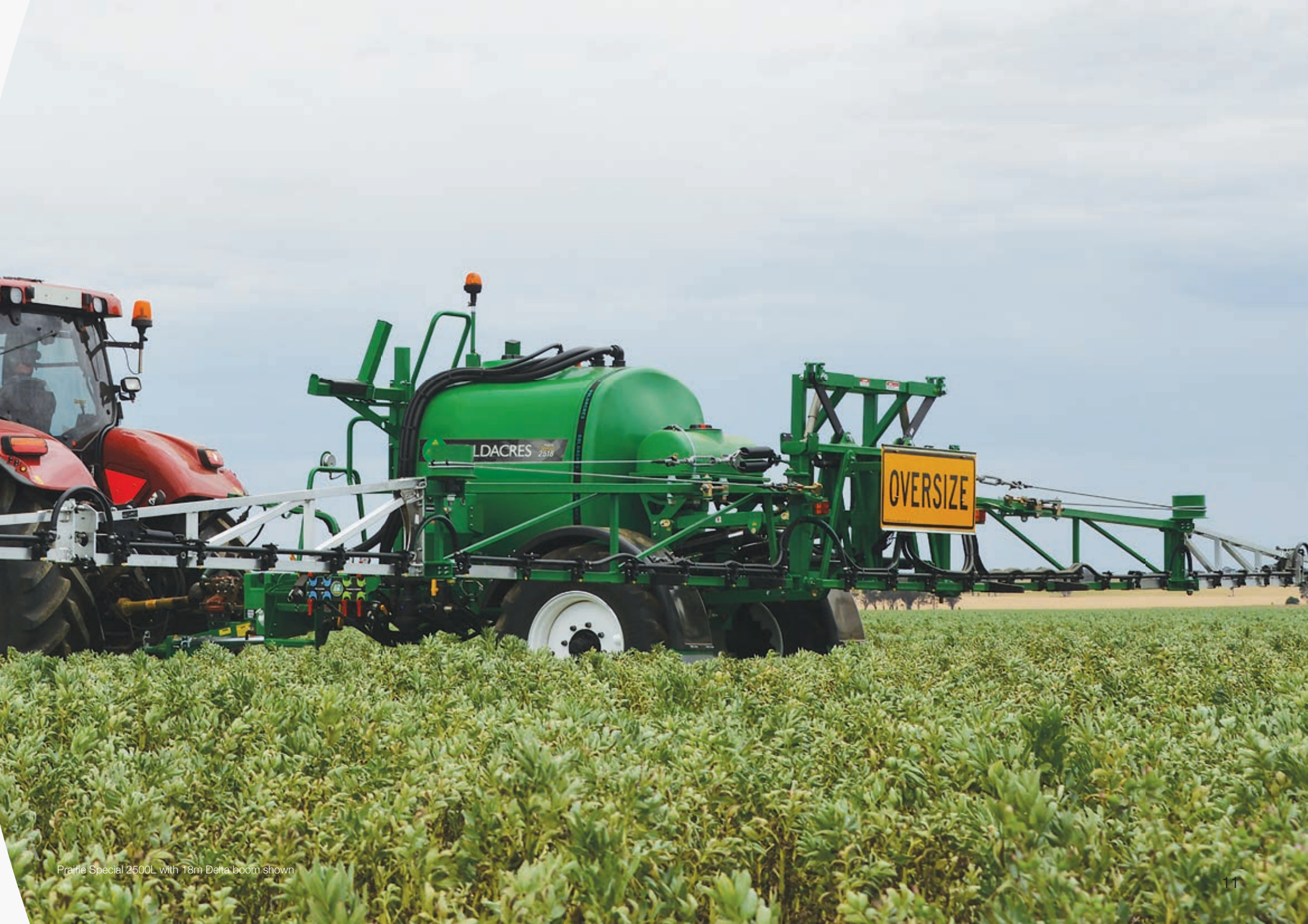
Prairie Special 2500L with 18m Delta boom shown