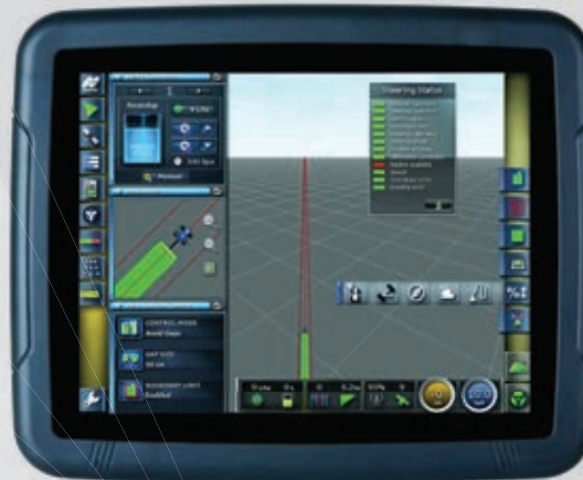
TopCon X30 - ISO Bus