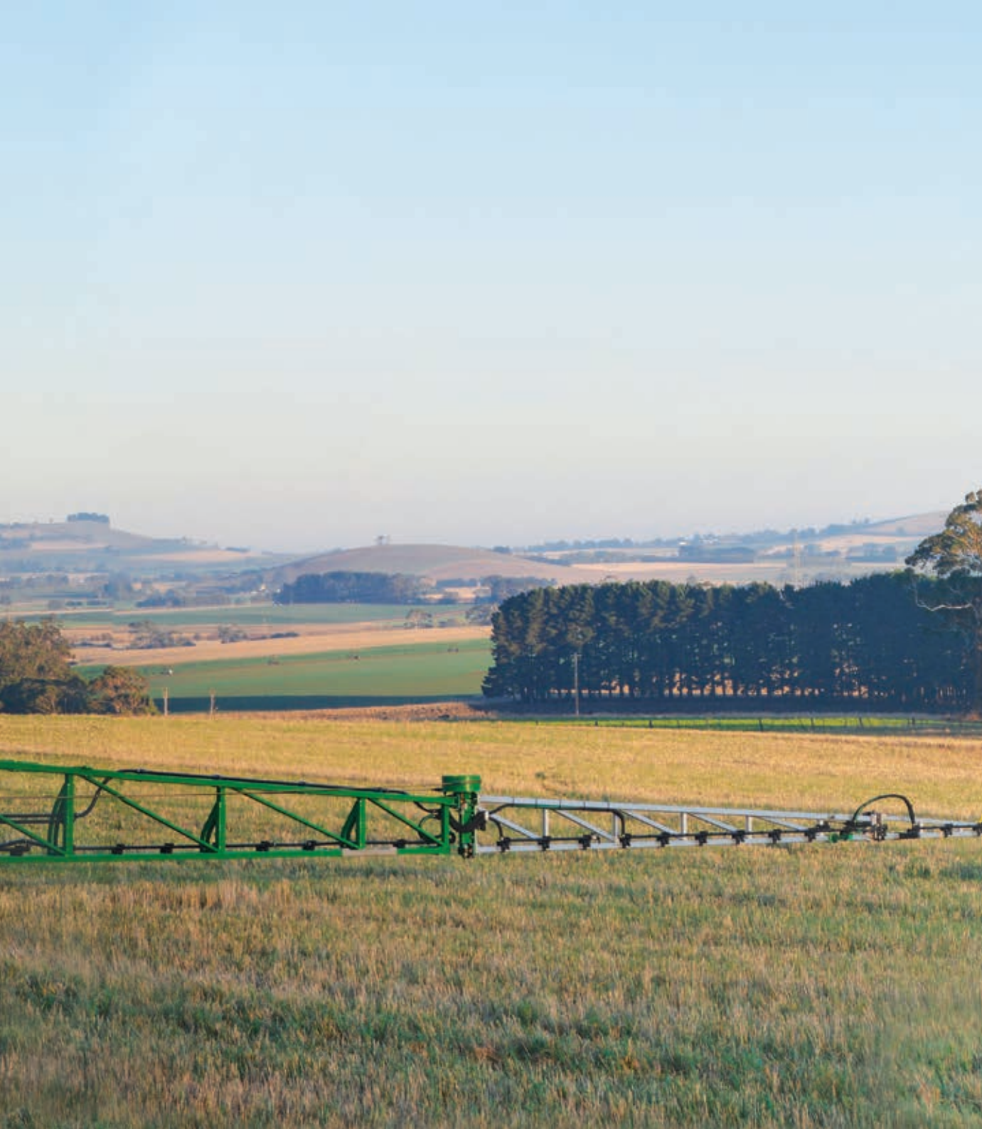
Small frame 1500 / 2000 / 2500 & 3000L