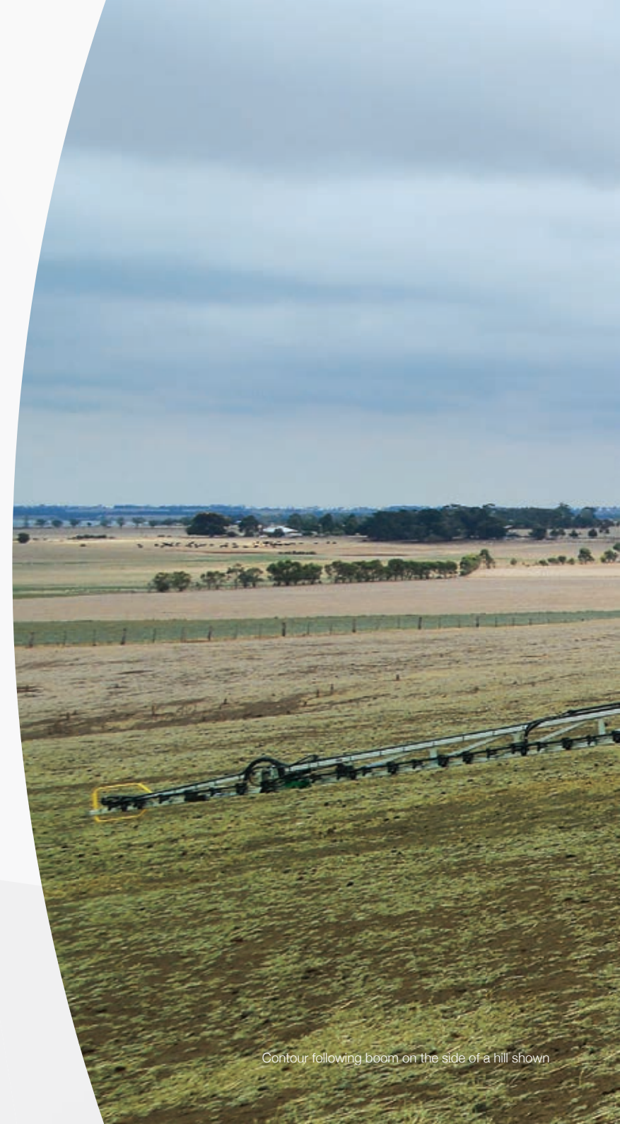
Contour following boom on the side of a hill shown

Both Delta and TriTech booms are contour following, meaning that the boom level will be referenced to the sprayer chassis and not purely on gravity such as a pendulum boom. This allows the sprayer to traverse the sides of hills and contours whilst keeping the boom level to the ground at all times. This results in placing the nozzle at the optimum height above the target.