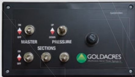
3 way electric section & regulation control (1500-2500L only)