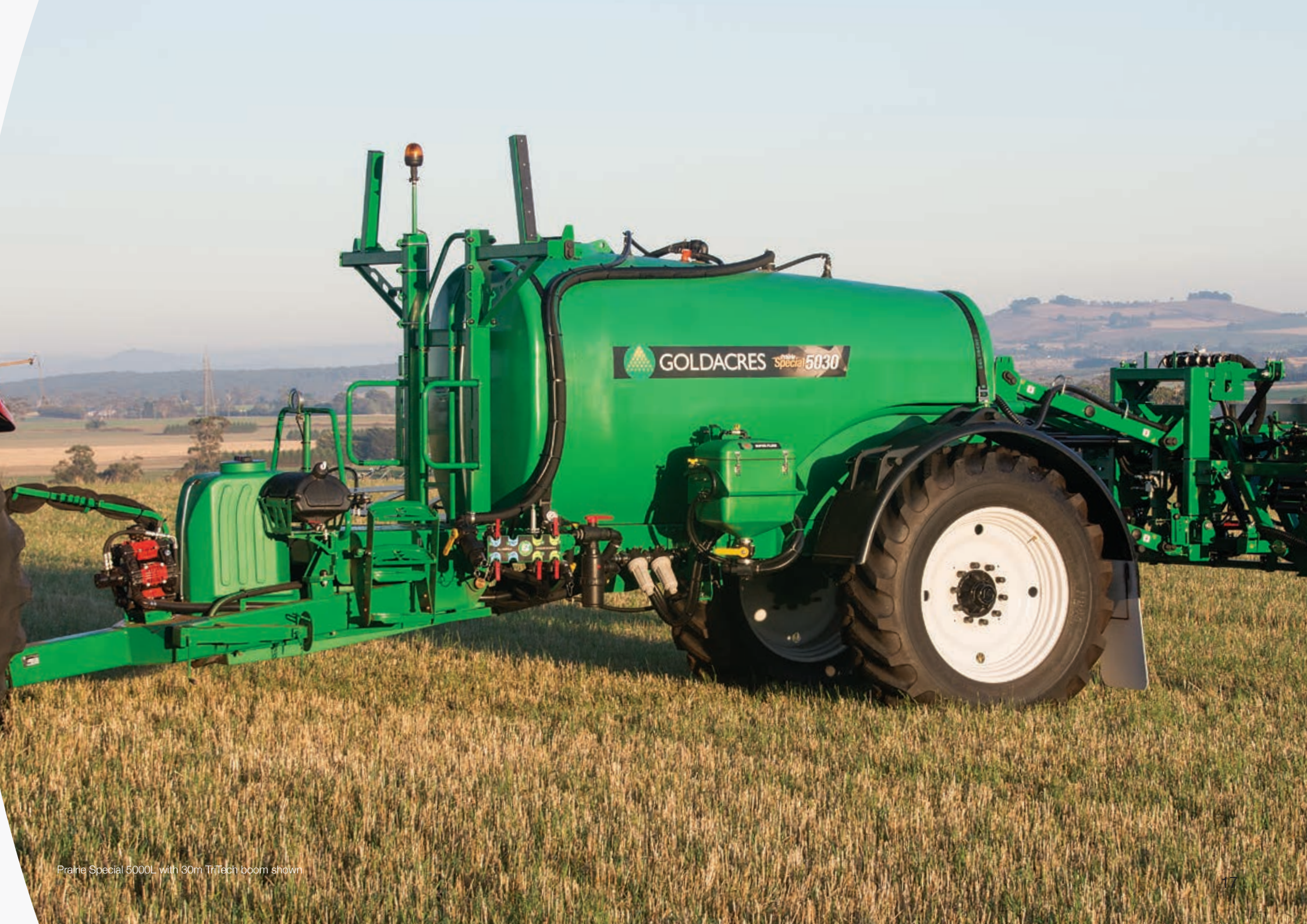
Prairie Special 5000L with 30m TriTech boom shown