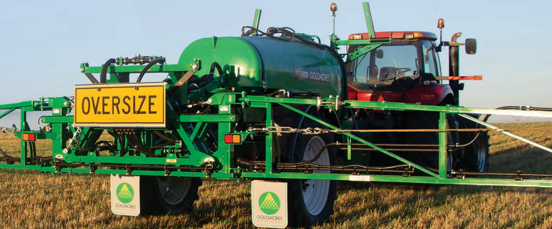
Prairie Special 5000L with 30m TriTech boom shown