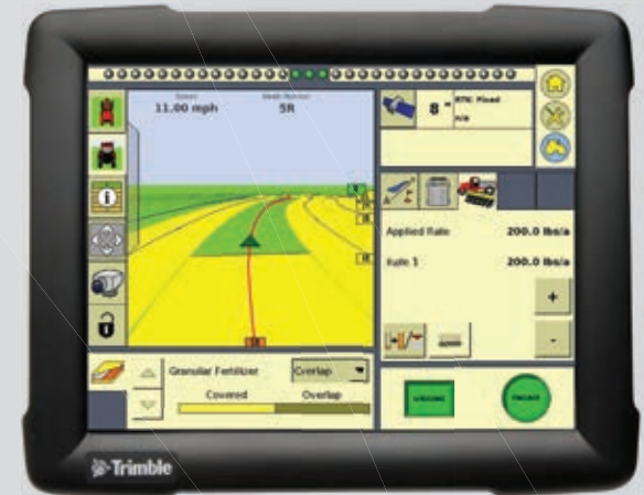
Trimble® FmX® 1000 - ISO Bus